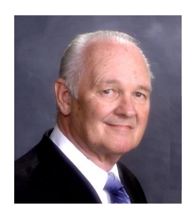
August 4, 1933 - April 19, 2015