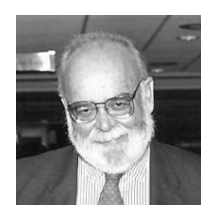
May 31, 1934 – March 17, 1997